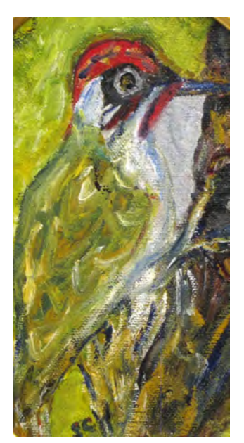
29 S. C. West Green Woodpecker Oil £36.50