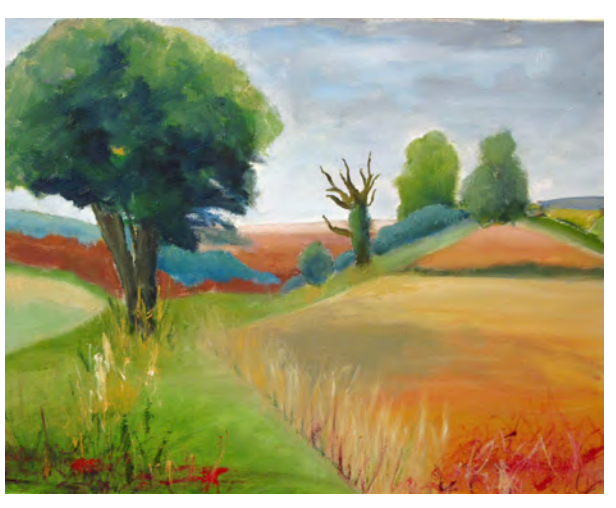
4 Nena Parkes A Favourite Place Oils £80

This picture is a study of a famous painting by Raphael completed between 1509-10. The original painting is also known as The Garvagh Madonna.