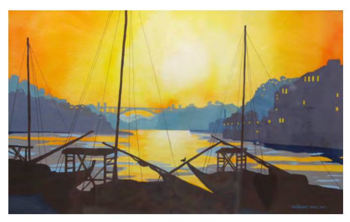
1 Nicholas Rous River Douro, Portugal Gouache £180