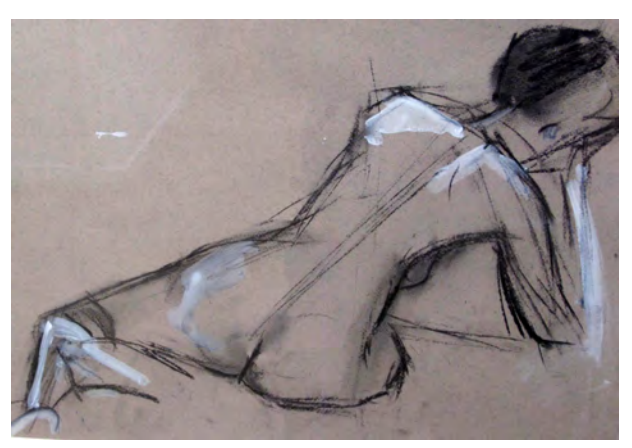
9 Rosemary Clegg Leserin Charcoal and gouache £50