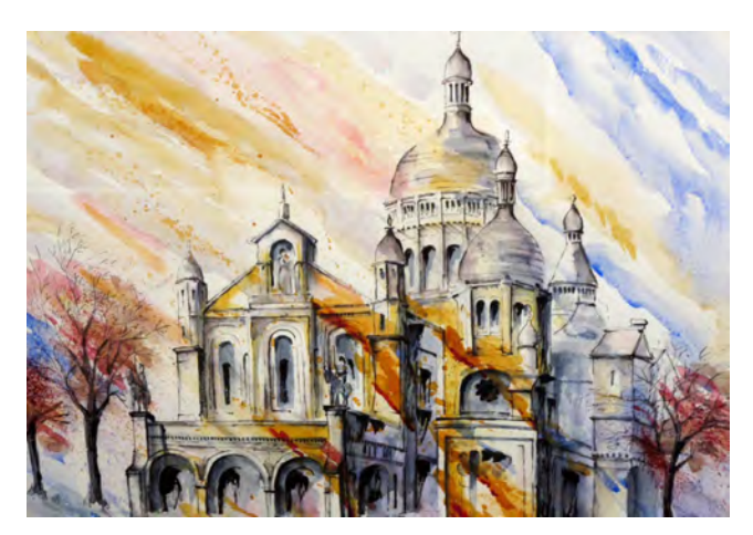
12 Jenny Bowden The Sacred Heart, Paris Ink and watercolour £200