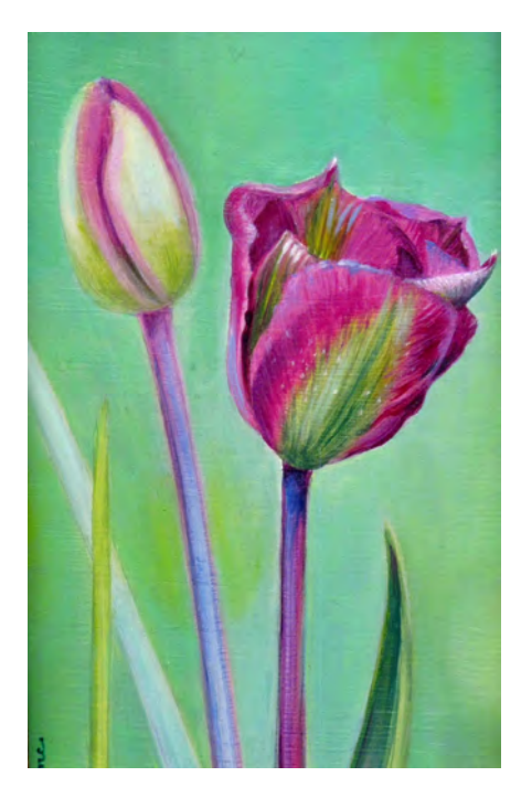
22 Julie Sailing-Free Tulipa Violet Bird Oil on board £75