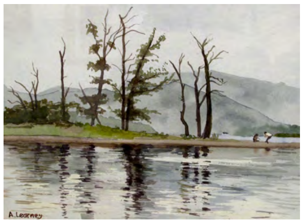
19 Alan Learney Ullswater 3 Watercolour £60