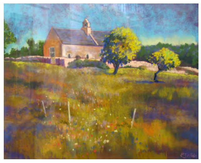
6 Eric White Widford Chapel: High Summer Pastel £120