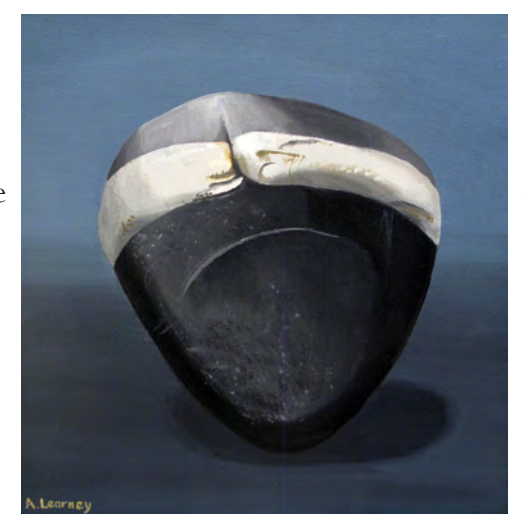
17 Alan Learney Pebble with Quartz Band Acrylic £75