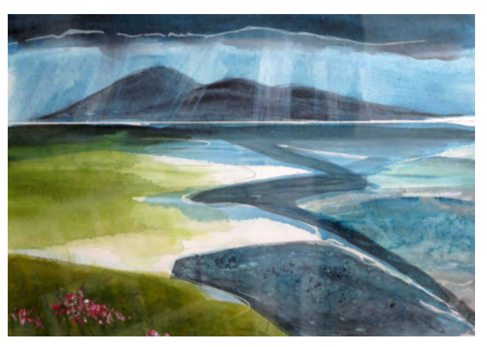
34 Nena Parkes Hebrides 3 Watercolour £250