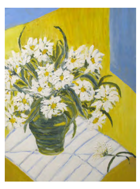
S. C. West Daisies Oil £105