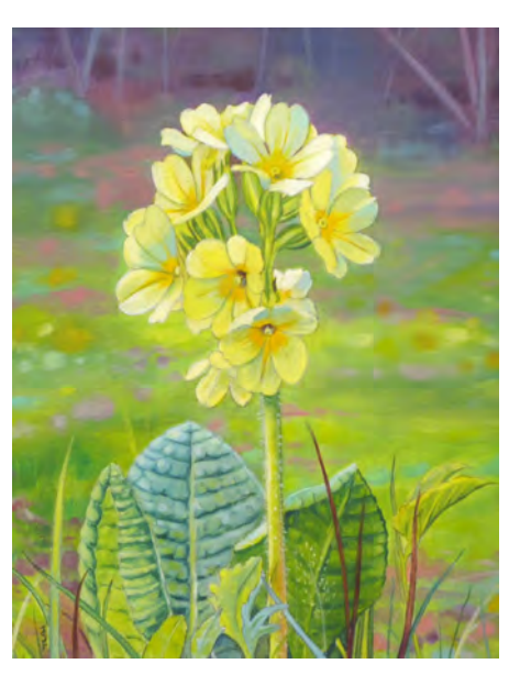
13 Julie Sailing-Free True Oxslip Oil on board £95