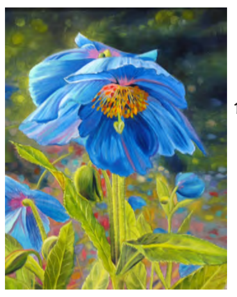
14 Julie Sailing-Free Meconopsis Oil on board £95