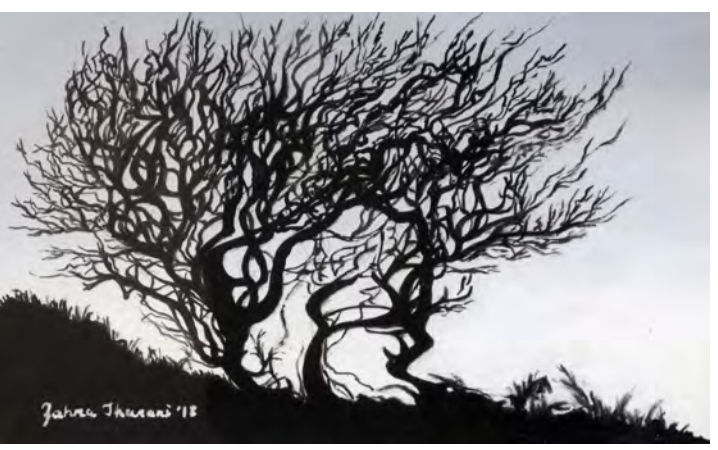
23 Zahra Tharani Solitude and Reflection Oils £105