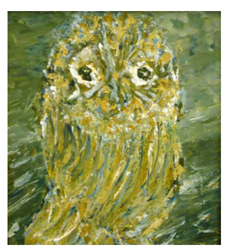
30 S. C. West Baby Owl Oil £28.50