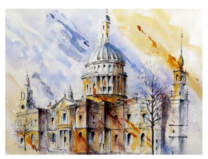
11 Jenny Bowden St. Paul's Cathedral, London Ink and watercolour £200