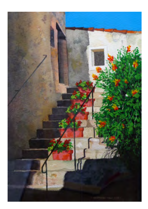
35 Nicholas Rous Floral Steps, Provence Gouache £130