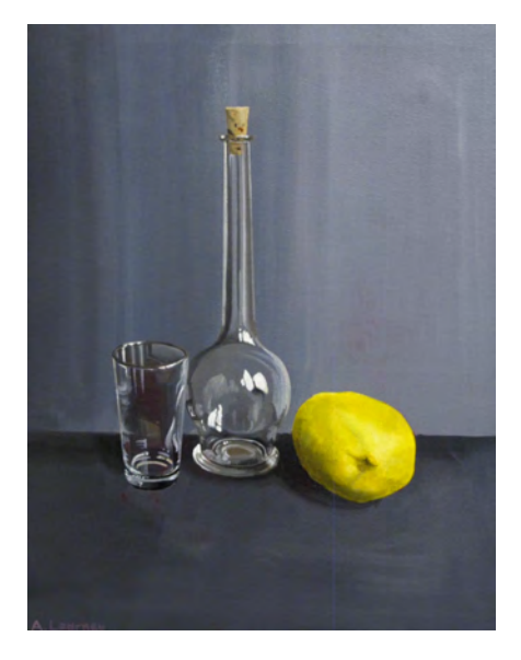
16 Alan Learney Still Life with Lemon Acrylic £95