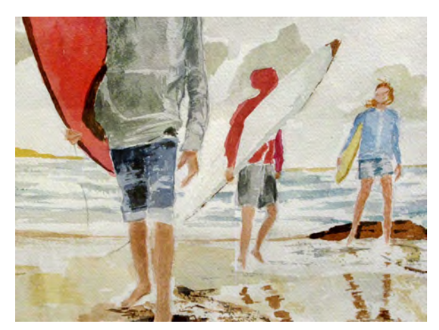
20 Christine Dowling Surfers Watercolour £160