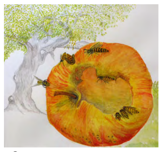
28 John Bartle The Wasp's Feast Watercolour £90