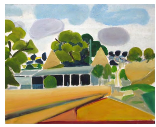
5 Nena Parkes A Favourite Place I Oils £80