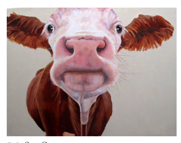
29 Sue Cox Carter Oil/emulsion on canvas £95