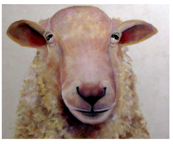
28 Sue Cox Sheldon Oil/emulsion on canvas £95