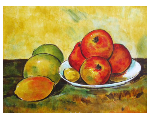
21 Gordon Whiting Fruit bowl Acrylic on board £250