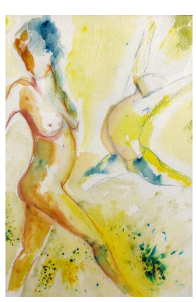
15 Rosemary Clegg Spring fever Watercolour £80