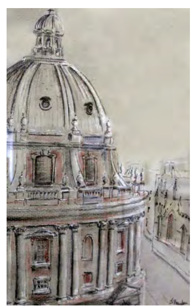
10 Jenny Bowden The Radcliffe Camera Charcoal and chalk £55