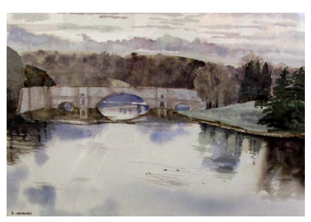
8 Alan Learney Blenheim Winter Watercolour £70