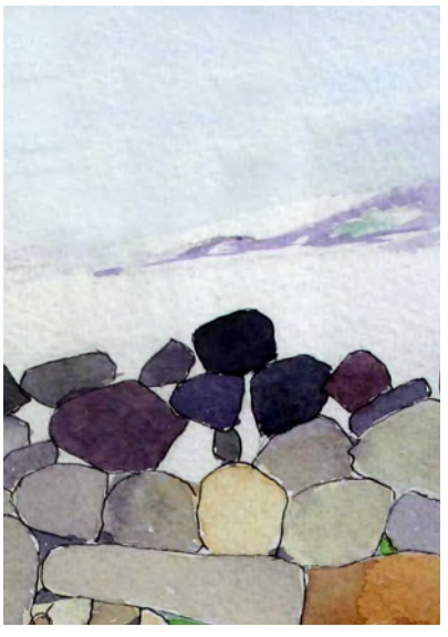
22 Christine Dowling Shining sea evening, Connemara Watercolour, pen and ink NFS