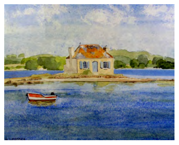
7 Alan Learney St Cado, Brittany Watercolour £60