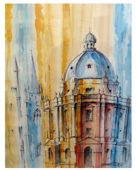
19 Jenny Bowden The Radcliffe Camera Watercolour and ink £150