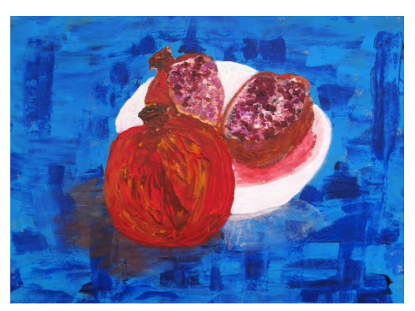
17 Jane Hale Pomegranates Acrylic £35