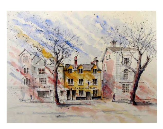
12 Jenny Bowden The Eagle and Child Watercolour £130