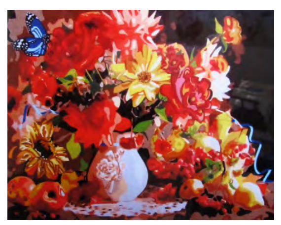
20 Zahra Tharani Seasons of life German etching print £40