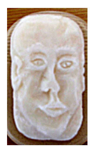
30 Jane Hale Soap Sculpture Hand soap £10