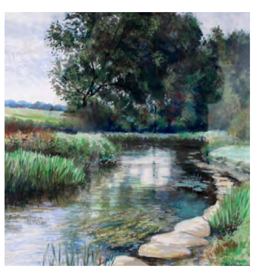
2 Eric White Water's edge. River Coln near Bibury Pastel and acrylic ink £165