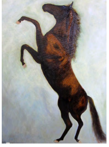
6 Diana Homer Joie de Vivre Oil £90