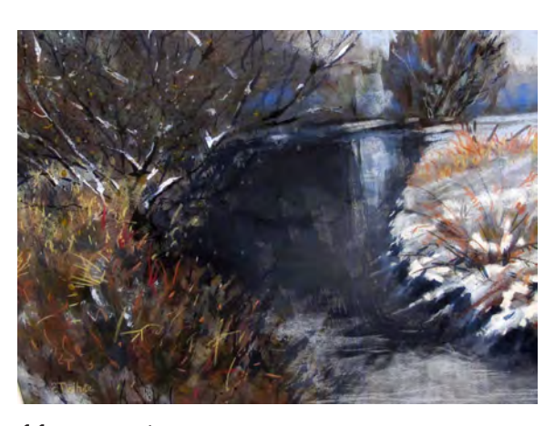
11 Eric White January snow, River Windrush Mixed media £150