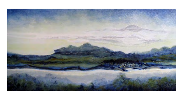
5 Diana Homer Clouds over the island Mixed media £50