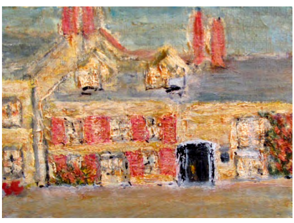
26 S.C.West A glimpse of Mill Street Oils £38.50