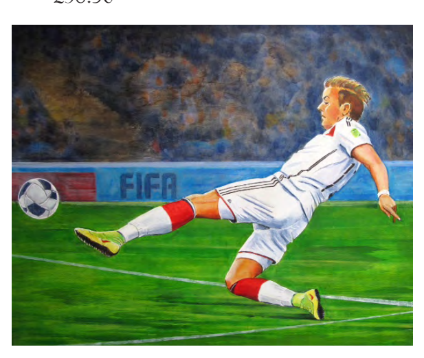
27 Gordon Whiting The shooter Acrylic on board £395